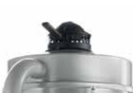
Pressure release valve for easy filter cleaning.