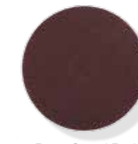
Bona Scrad Pad