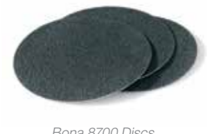
Bona 8700 Discs