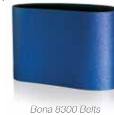
Bona 8300 Belts