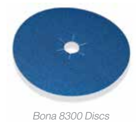
Bona 8300 Discs