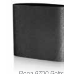
Bona 8700 Belts