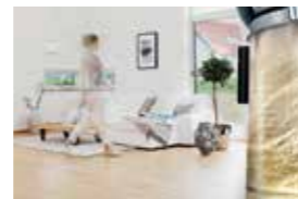
Unique 2-step cyclonic filter separation process.