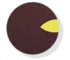
Bona Scrad with Wing