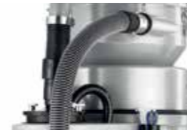
Fully sealed system certified 99.9% effective.