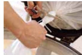
Seamless bag system prevents dust leaks when changing.