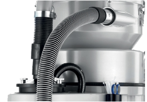
Fully sealed system certified 99.99% effective.