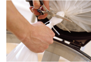
Seamless bag system prevents dust leaks when changing.

The reason for sanding a floor is to obtain a perfect finish. Residual dust left after sanding remains in the air and is detrimental to the end finish. With dust-free sanding the finish is applied to a cleaner surface, so the only thing left is a stunningly beautiful floor. The end to end Bona DCS system has all the components to eliminate dust completely.