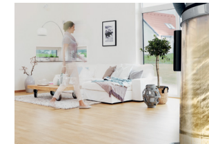
Unique 2-step HEPA cyclonic filter separation process.