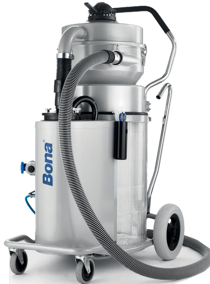
Bona DCS 70