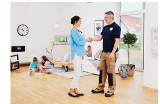
No health risk to families or contractors.